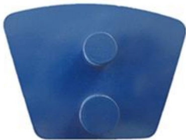
Two Round Pins Redi Lock Blank

Redi Lock is available in a range of colours to match your concrete.