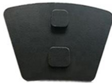
Two Square Pins Redi Lock Blank