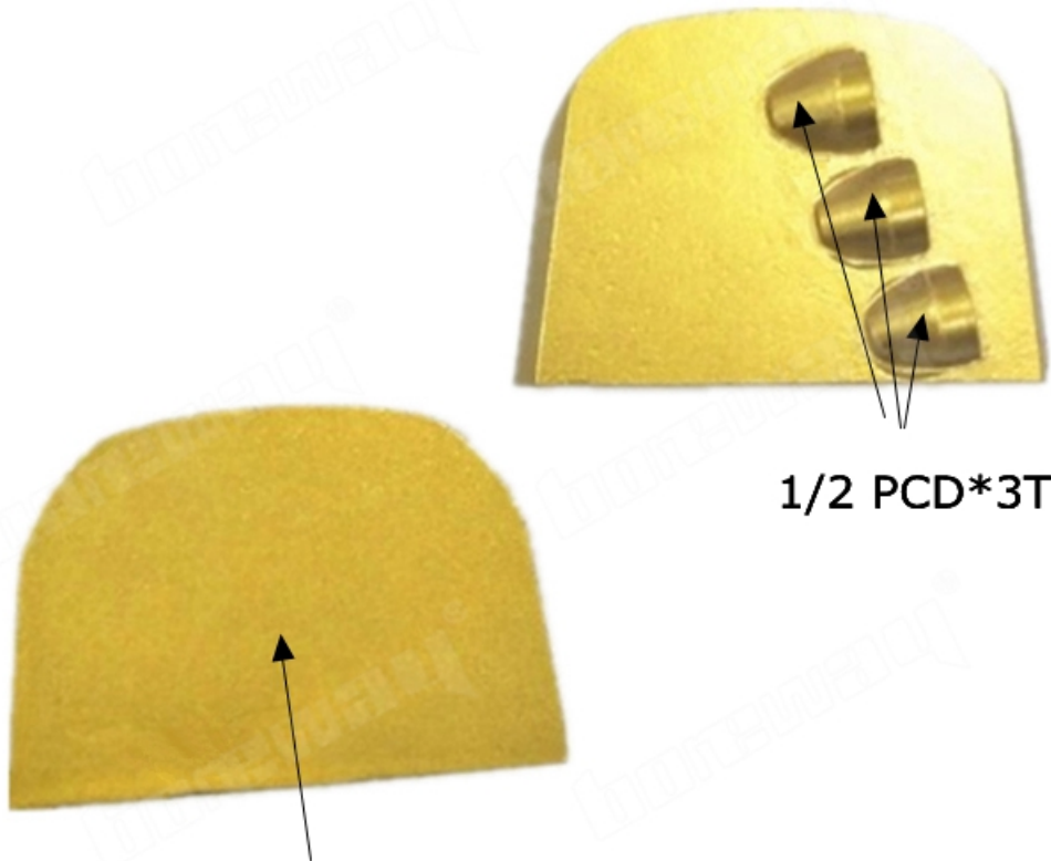
Lavina Quick Conncting Grinding Machine