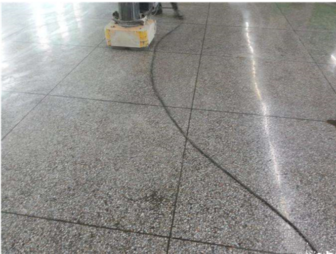
Before Grinding and Polishing