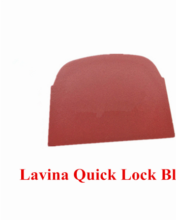
Lavina Quick Lock Blank