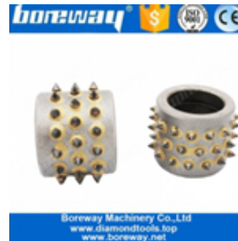
45S Bush Hammer Roller