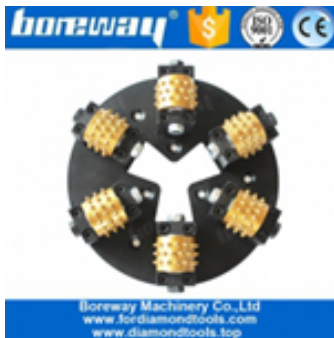
HTC 270MM 45S Litchi Surface Plate