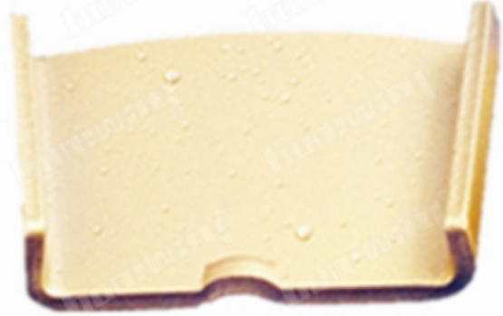
Double Oval Shape