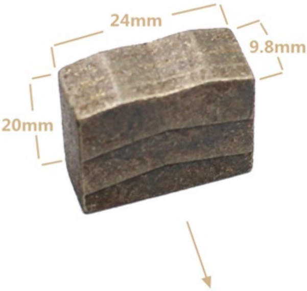
M Shape Multi-Layer Structure, Good debris removal and better cooling