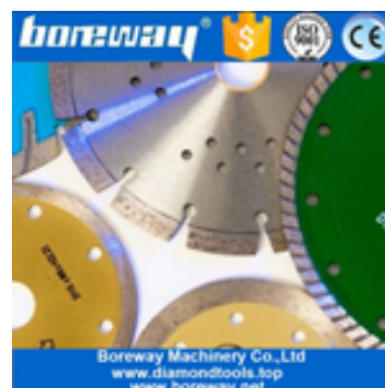
5 Inch Hot Pressed Segments Cutting Disc

Boreway Machinery Co., Ltd www.diamondtools.top www.boreway.net