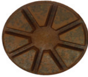
Floor Polishing Pads With Metal