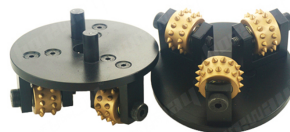
HTC Bush Hammer Plate

Boreway Machinery Co.,Ltd www.fordiamondtools.com www.diamondtools.top