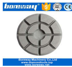
Diamond Floor Renovate Pads