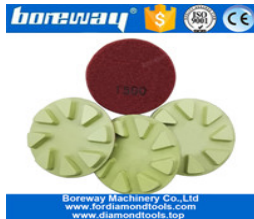
Flower Floor Polishing Pad