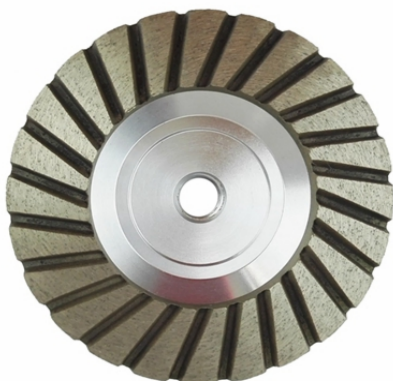
4 inch #100