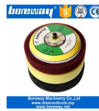
5 Inch Foam Backer Pad