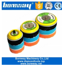
5/16"-24 Thread Backer Pad