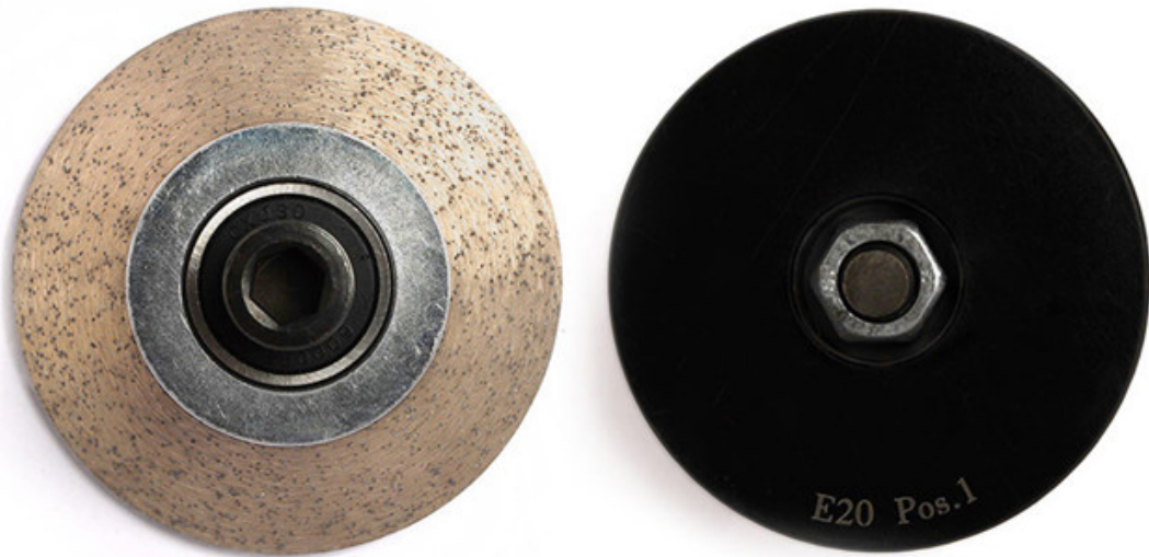
M10 Thread Diamond Profile Wheel