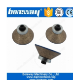
Metal Continuous Diamond Router Bits