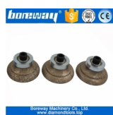
020xM10 Continuous Diamond Router Bit