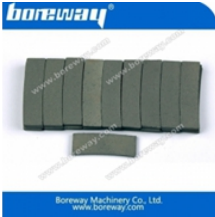
Edge Cutting Segment for Granite