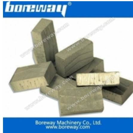
Block Cutting Segment for Marble