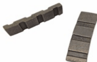
Turbo Shape Edge Segment