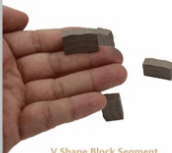
V Shape Block Segment