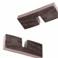
U Slot Edge Segment