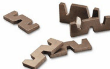
W Shape Edge Segment