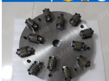
Boreway Machinery Co., Ltd www.diamondtools.top www.boreway.com