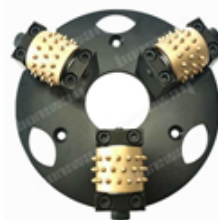
Boreway Machinery Co., Ltd www.fordiamondtools.com www.diamondtools.top