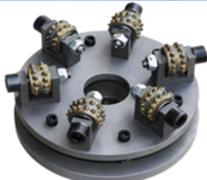
Boreway Machinery Co., Ltd www.diamondtools.top www.boreway.com