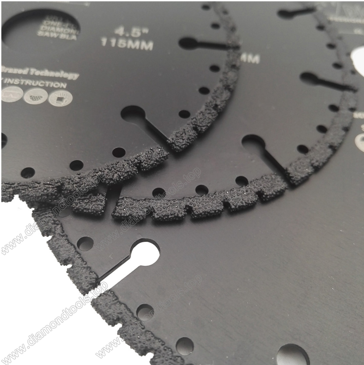
115MM Vacuum Brazed Diamond Blade for All Purpose Demolition Blade