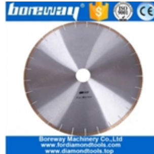
14 Inch Marble Saw Blade