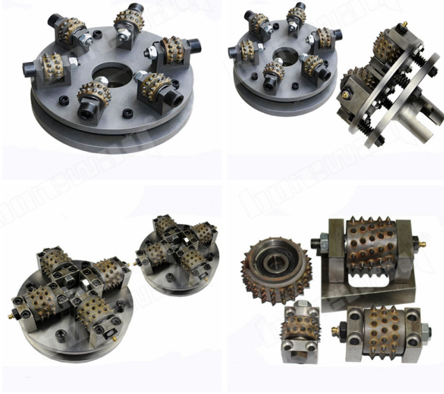
Concrete and Stone Frankfurt Bush