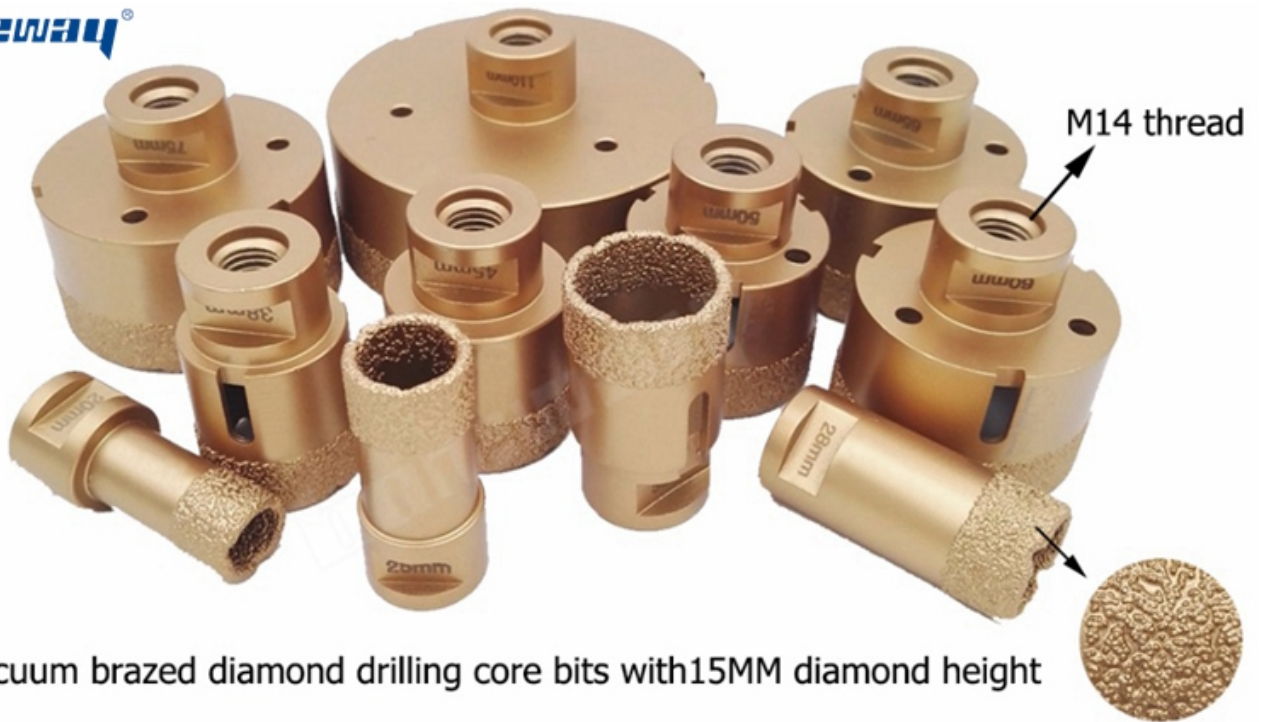
Vacuum brazed diamond drilling core bits with 15MM diamond height