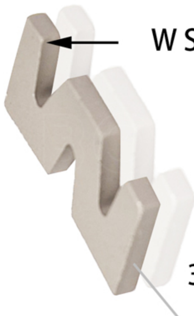
W Shape Segment