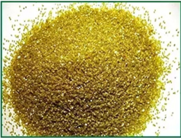
E6 diamond powder ,one of the best quality diamond powder in the world.