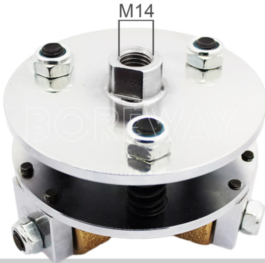
Vacuum Brazing Bush Hammer Roller