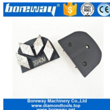
Four Segments Grinding Shoes