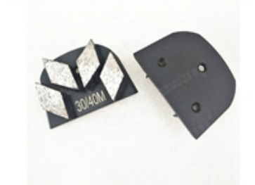
Boreway Machinery Co.,Ltd www.diamondtools.top www.boreway.net