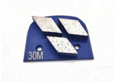
Boreway Machinery Co.,Ltd www.diamondtools.top www.boreway.net