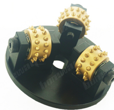
HTC 270MM Bush Hammer Plate

Boreway Machinery Co.,Ltd www.fordiamondtools.com www.diamondtools.top