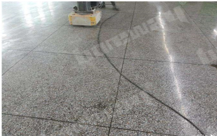
Before Grinding and Polishing