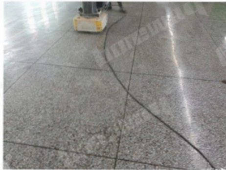
Before Grinding and Polishing