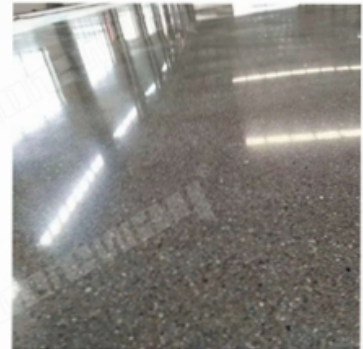
After Grinding and Polishing