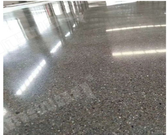
After Grinding and Polishing