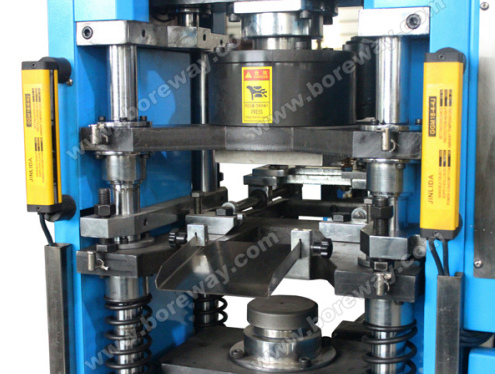
Boreway Machinery Co., Ltd. www.diamondtools.top www.boreway.com