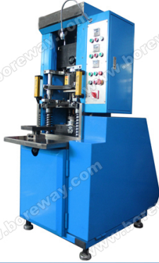
Boreway Machinery Co., Ltd. www.diamondtools.top www.boreway.com