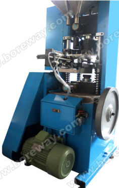
Boreway Machinery Co., Ltd. www.diamondtools.top www.boreway.com