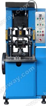
Boreway Machinery Co., Ltd. www.diamondtools.top www.boreway.com