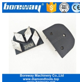
Four Segments Grinding Shoes