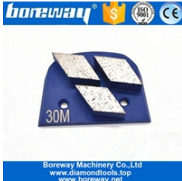
Three Segments Grinding Shoes