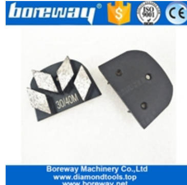
Four Segments Grinding Shoes