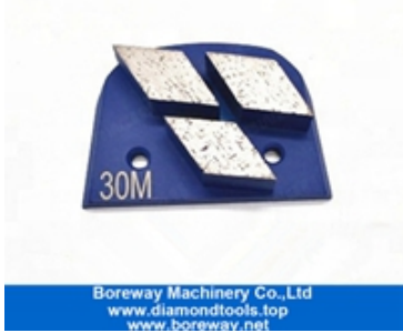
Three segment grinding shoes