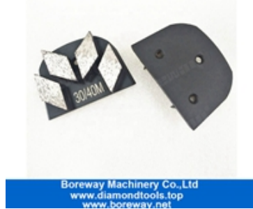
Four Segment Grinding Shoes