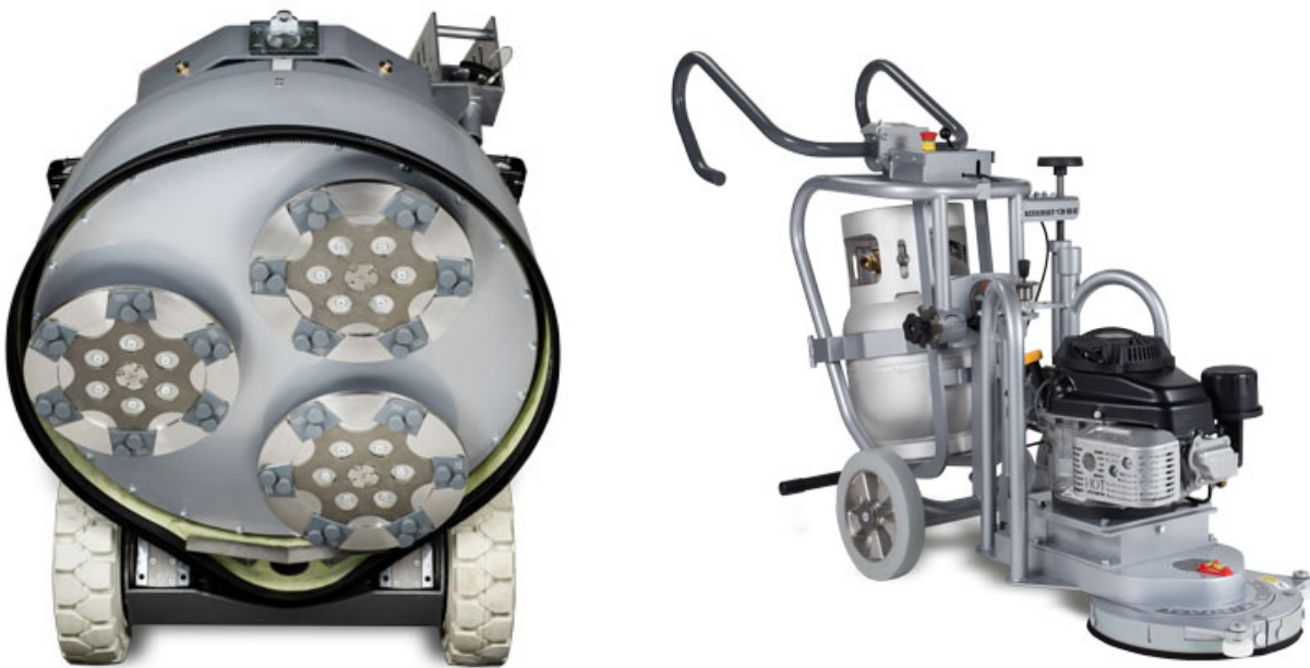
Lavina Diamond Tools With Two Quarter Round PCD Segments And Two Sacrificial Bars

Grinding shoes are designed for grinding and polishing concrete floors. Boots / Cakes come with soft bond, rigid bond and standard medium bond and mixed grits. These concrete diamond grinding shoes fit into the fast change style piece and polishing heads. Grinding shoes are designed for extended life compared to the competition with a jumbo-size segment and a lower grinding cost per square yard.