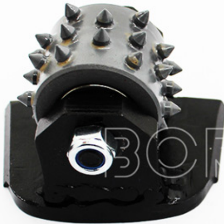
For Lavina X Series Grinder