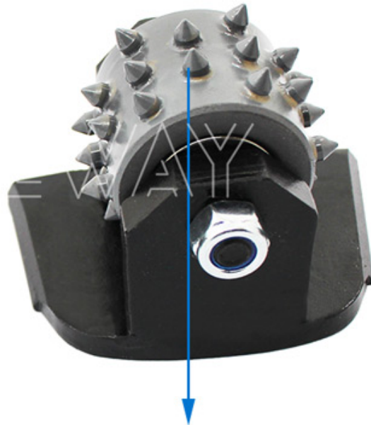
Bush Hammer Block