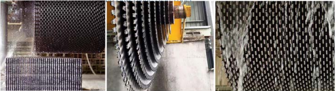
Multi blade block cutter (Single Size)