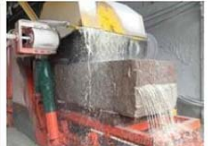
Mu lit blade block cutter (Multi Sizes)