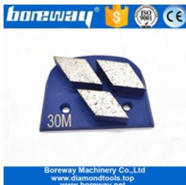
Three Segments Grinding Shoes