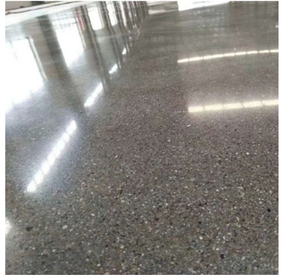
After Grinding and Polishing