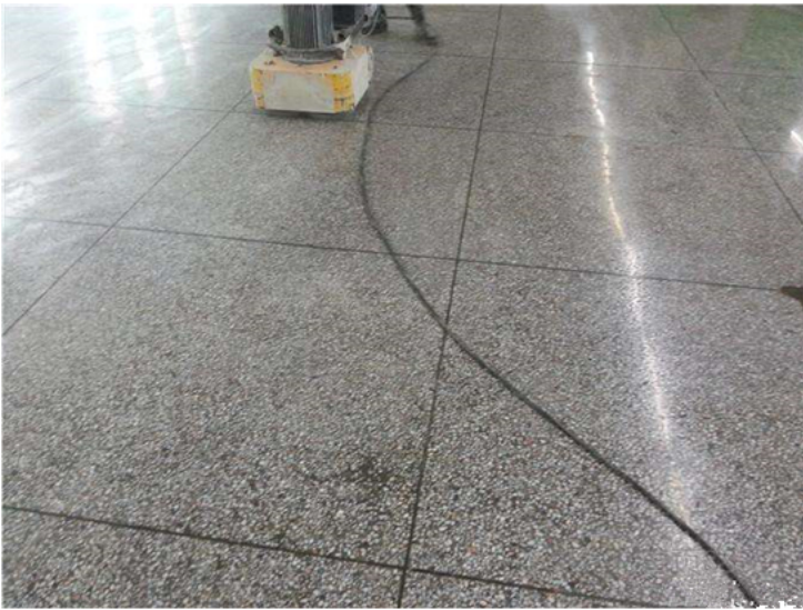
Before Grinding and Polishing