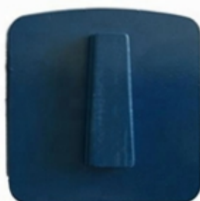
Husqvarna Redi Lock Blank Scanmaskin Blank