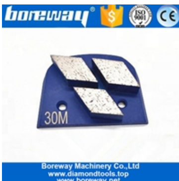
Three Segments Grinding Shoes