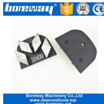
Four Segments Grinding Shoes