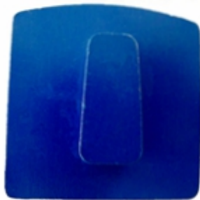
Husqvarna Redi Lock Blank

Scanmaskin Redi Lock Blank, Perfect Fit in Scanmaskin Grinding Machine.