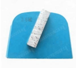
Boreway Machinery Co.,Ltd www.diamondtools.top www.boreway.net