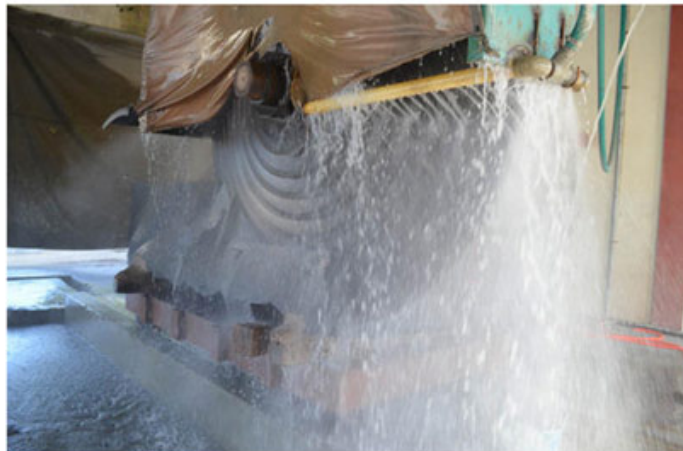
Multi Saw Blade