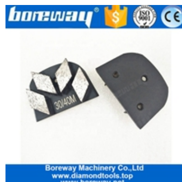
Four Segments Grinding Shoes