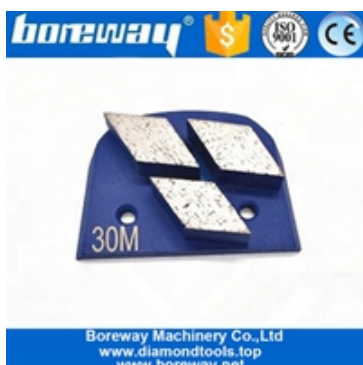
Three Segments Grinding Shoes