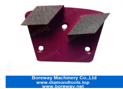
2 Rhombus Grinding Shoes