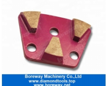
3 Trapezoid Grinding Shoes