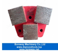
3 Square Grinding Shoes