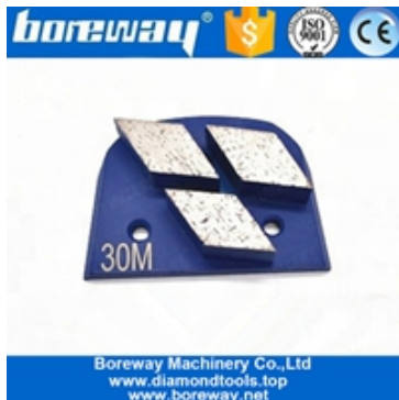
Three section grinding shoes