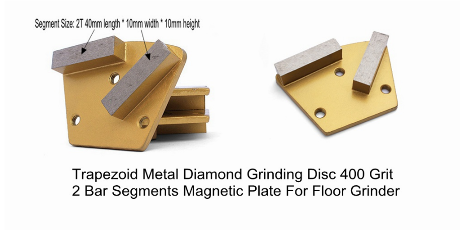
Trapezoid Metal Diamond Grinding Disc 400 Grit 2 Bar Segments Magnetic Plate For Floor Grinder