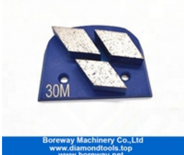
Three Segments Grinding Shoes