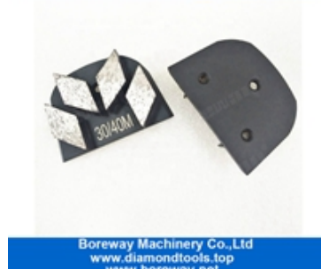
Four Segments Grinding Shoes