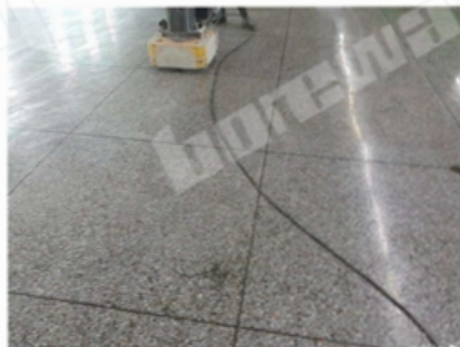
Before Grinding and Polishing