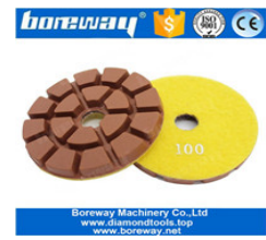
Resin Floor Polishing Pads