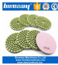
Resin Bond Concrete Floor polishing pads