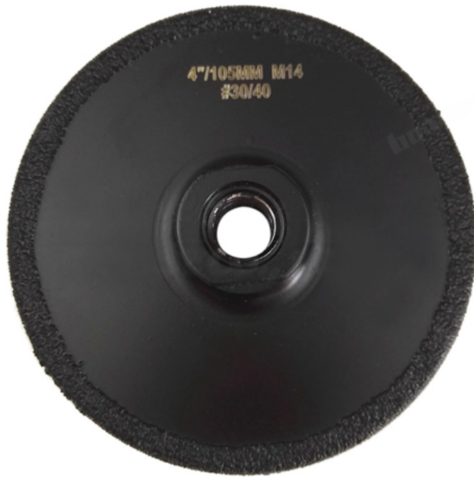
M14 Thread Vacuum Brazed Diamond Grinding & Cutting Wheel

Boreway Machinery Co., Ltd. www.diamondtools.top www.boreway.com