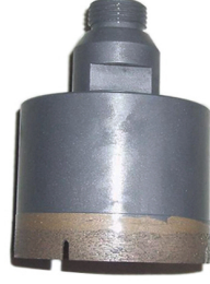
Diamond coring drill bit

Boreway Machinery Co., Ltd. www.diamondtools.top www.boreway.com